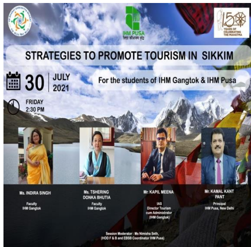
Poster of Webinar organised by Institute of Hotel Management Catering and Nutrition, Pusa, New Delhi on 30 th July 2021