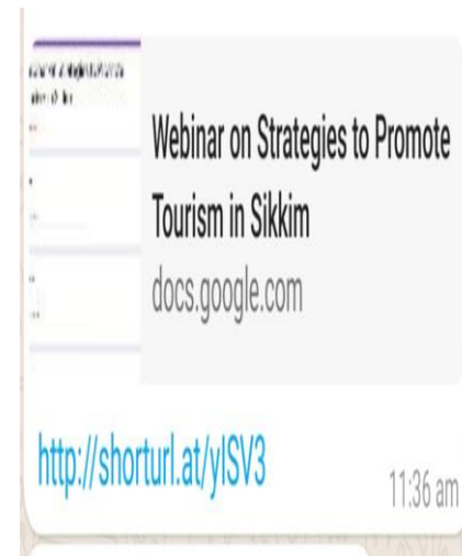
Registration form for the Webinar organised by Institute of Hotel Management Catering and Nutrition, Pusa, New Delhi on 30 th July 2021